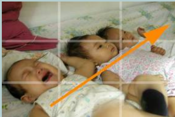
look for interesting perspective, rather than plainly shooting them straight on