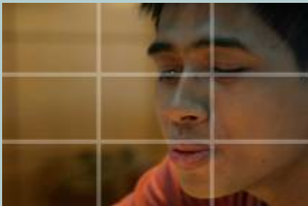
Looks better to cut head than chin