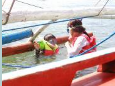
Using foreground to establish position