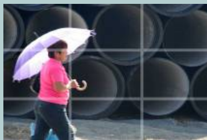
Provide room to her direction