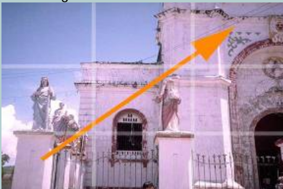
Your subject can suggest the composition